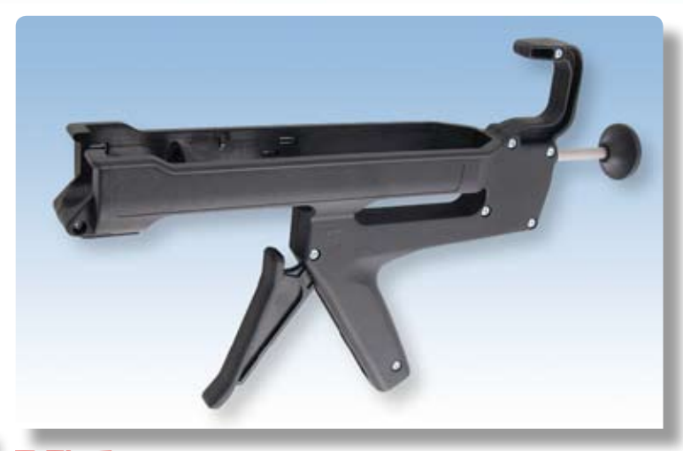
Original Design & Manufacturing